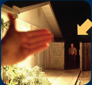
Glare hides the intruder