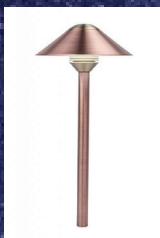
FXLuminaire® CA Path Light

For more information on dark-sky friendly products, visit "Find Dark Sky Friendly Lighting" at darksky.org