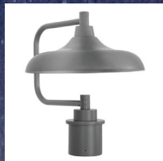
Ranch Post Mount