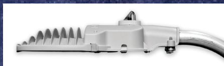
Evluma AreaMax Pole Light