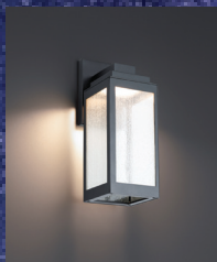
WAC Lighting Amherst Wall Sconce